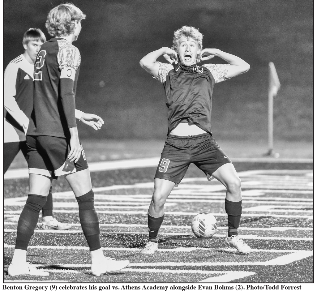
in the 66th when Mancillas' cross pass led to a sliding score

Solario added two goals in the second half, the first coming in the 63rd minute off a feed from junior Noah Sommer. Athens answered a minute later, but Solario grew the lead to 6-1